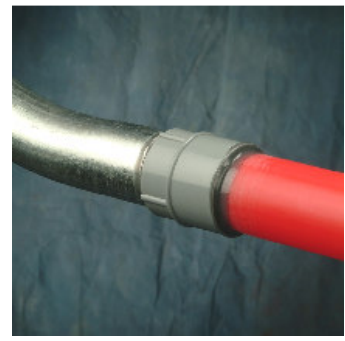
Polyethylene to Steel