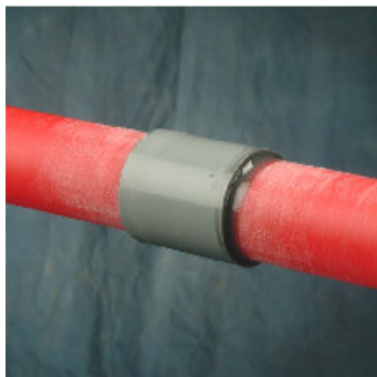
Polyethylene to Polyethylene

BonDuit TM Adhesive creates airtight and watertight splices. Bonds are durable with high tensile strength within an hour. The strong bonds withstand movement and vibration.