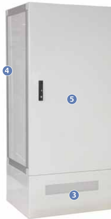
NetXtend™ Flex Series