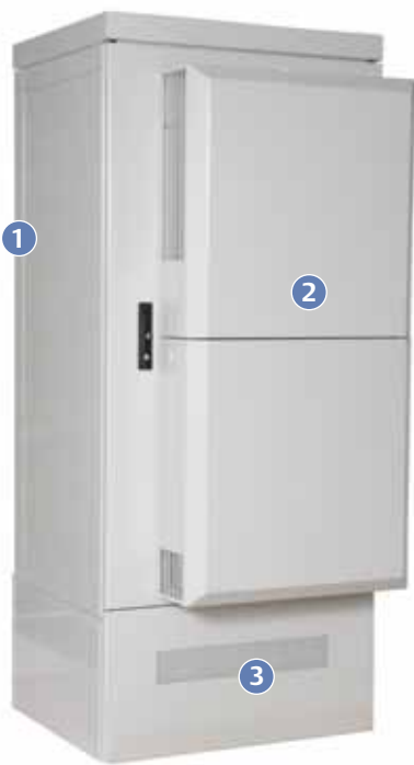
NetXtend™ Flex Series (shown with integrated heat exchanger)