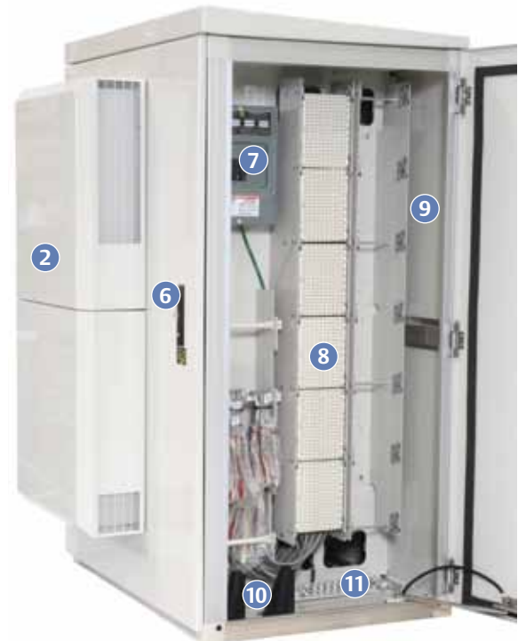
NetXtend™ Flex Series (shown with open side chamber)