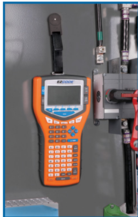
When you're working in tight spaces, the handy magnet strap lets you to stick the EZL500 printer to a vertical metallic surface to free your hands until you need to use it again.

In short, the EZL500 printer is ready to work on the lengthy jobs you have now and the ones you'll be doing years down the road.