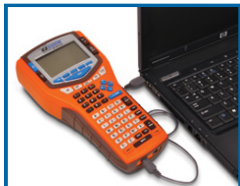
With the included PC connection software and built-in mini USB port, you can print directly from your computer and easily upgrade the software