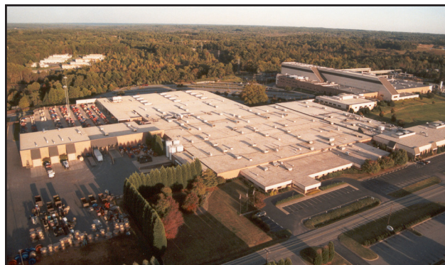
Claremont, North Carolina